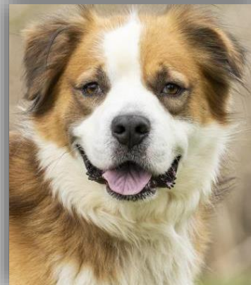
Our guy Beethoven! Please refer an adopter.